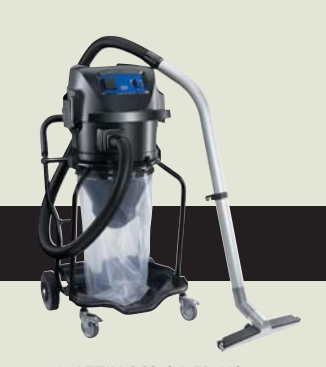
▲ ATTIX 963-21 ED XC